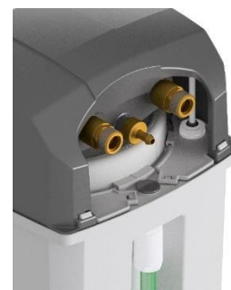
Joint 3/4" G