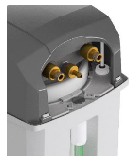
Joint 3/8" G